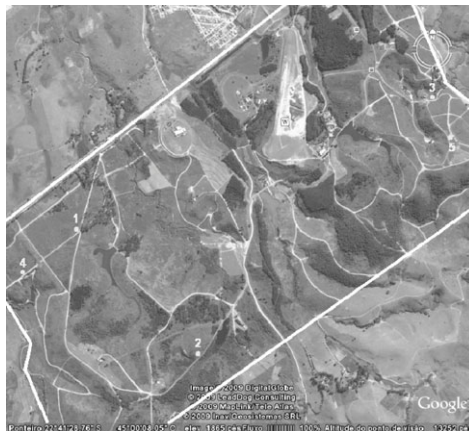
Figure 1. Satellite view (Google Earth, 2009) of INPE-Cachoeira Paulista (INPE-CP) area showing the five numbered places where RFI measurements have been done.

Figures 1 shows a satellite view of INPE-CP area with the five chosen places for RFI measurements numbered. Mounting used for the 5–6 days continuous measurements is composed of: a discone antenna, LNA with an approximately flat response in the above frequency range, portable spectrum analyzer (FSH6, 100 kHz - 6 GHz; R&S) and a portable computer as shown in Figure 2. Figure 3 shows the results of measurements at the better place, numbered 3. It has to be remarked that place presented the most clean spectrum with only one short duration (ms pulse) low level ( \leq -80 dBm) signal recorded at 1875 MHz during one day of a 5–6 days period of measurements.